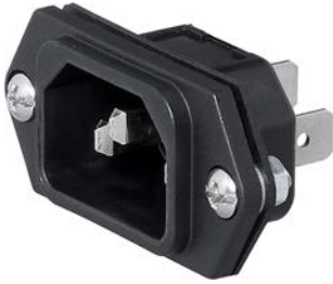
6100-3 with sealing kit IP54 to appliance (without locking brackets)